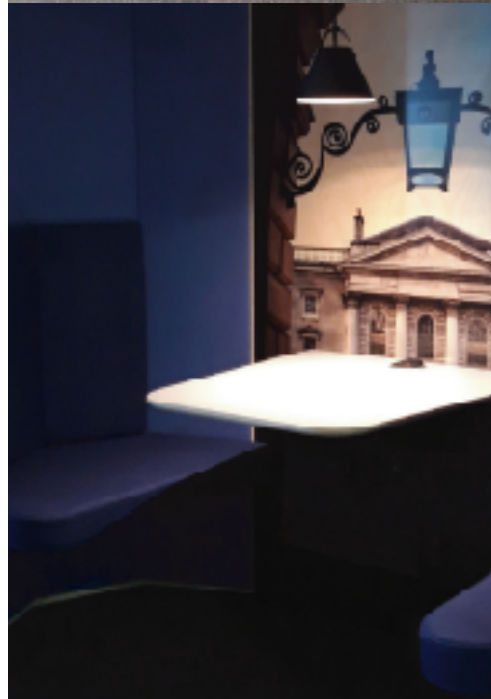
Project: CSD Hub at Trinity College Dublin

hiberform/ Spatial Division & Furniture Products A/ Mullies Manorhamilton Co. Leitrim Ireland T/+353(0)87 2725811 E/ info@hiberform.com T/ @hiberform www.hiberform.com